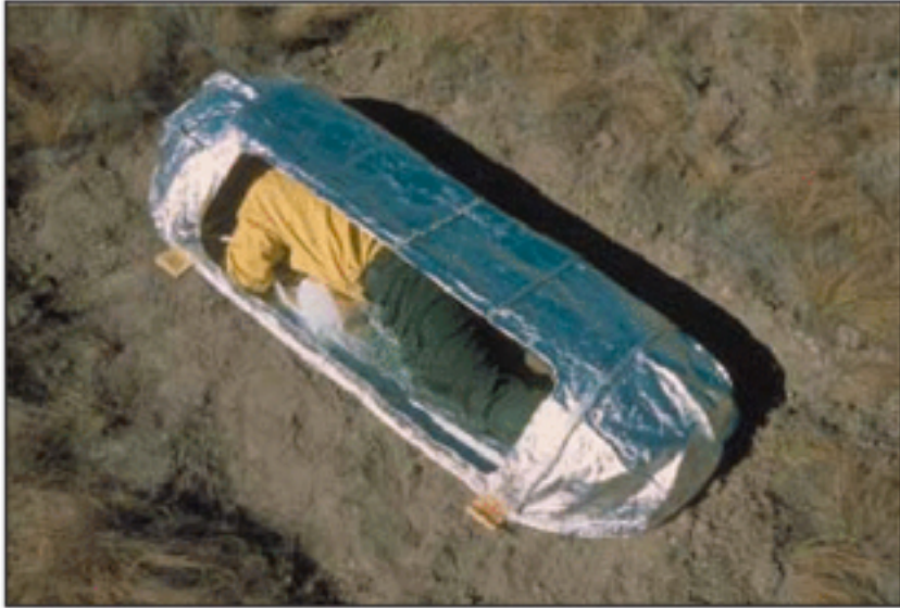
The standard-issue emergency fire shelter, from a Forest Service handbook on their use.